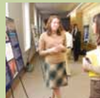
The annual poster session for the Downs International Health Student Travel Fellowship Program highlights student research conducted around the world.

2009 Smilow Cancer Hospital at Yale-New Haven opens