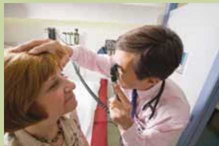
The physicians of Yale Medical Group conducted some 323,000 patient visits in 2009, providing services in more than 160 specialties and subspecialties.

More than 800 Yale physicians provide primary and specialty care for patients through Yale Medical Group. Yale Medical Group delivers advanced care in more than 160 specialties and subspecialties, and has centers of excellence in such fields as cancer, cardiac care, minimally invasive surgery, and organ transplantation. Yale physicians have made many historical contributions, including the first use of cancer chemotherapy, the first artificial heart pump and the first insulin infusion pump for diabetes. Today they perform groundbreaking procedures, including Connecticut's first appendectomy without an abdominal incision. They engage in translational research to offer new therapies, such as the development of man-made vascular grafts that have the ability to grow from a patient's own tissue. Yale Medical Group is a major referral center for Connecticut and New England, and treats patients from throughout the world.