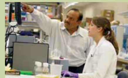
The medical school's core facilities provide researchers with access to the latest equipment and techniques, such as the rapid whole-genome sequencing available at the Yale Center for Genomic Analysis.