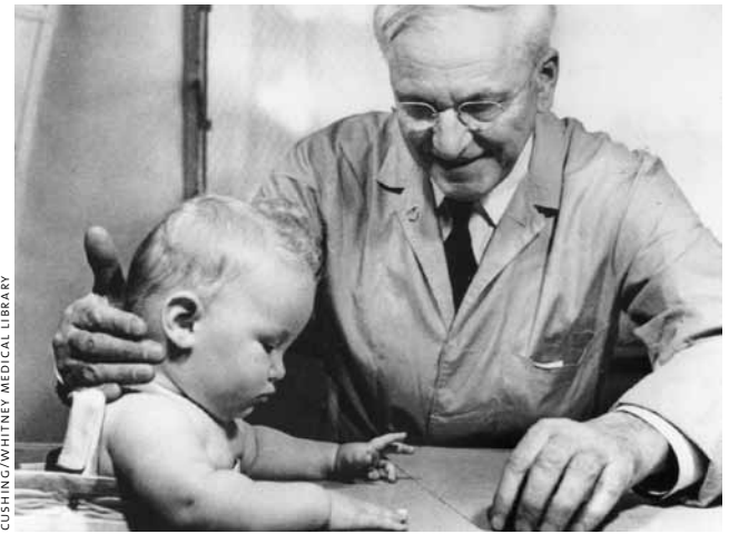
Arnold Gesell, founder of the clinic that would become the Yale Child Study Center and a pioneer in research on children, employed the relatively new medium of motion pictures to record and observe behavioral patterns in infants.

Over the last 100 years the CSC has been home to generations of faculty and trainees who have shaped both the science and social policy surrounding childhood development and mental health issues. The Center now includes the Edward Zigler Center in Child Development and Social Policy, named for Edward F. Zigler, PH.D., Sterling Professor Emeritus of Psychology and chief architect of the Head Start and Early Head Start programs. The Zigler Center has dramatically changed the landscape of services for children and families locally, regionally, and globally. James P. Comer, M.D., M.P.H.,