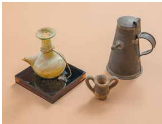
Among the noteworthy collections at Yale is Yale New Haven Hospital’s collection of baby bottles, which includes extraordinary examples from across a broad scope of cultures and human history dating back to ancient Rome. As is often the case, the collection was the result of one doctor’s curiosity and interest in the subject.

spout—sticking out from its side. Its makers called it a Mammele —“little breast” in German, according to Fink’s research.